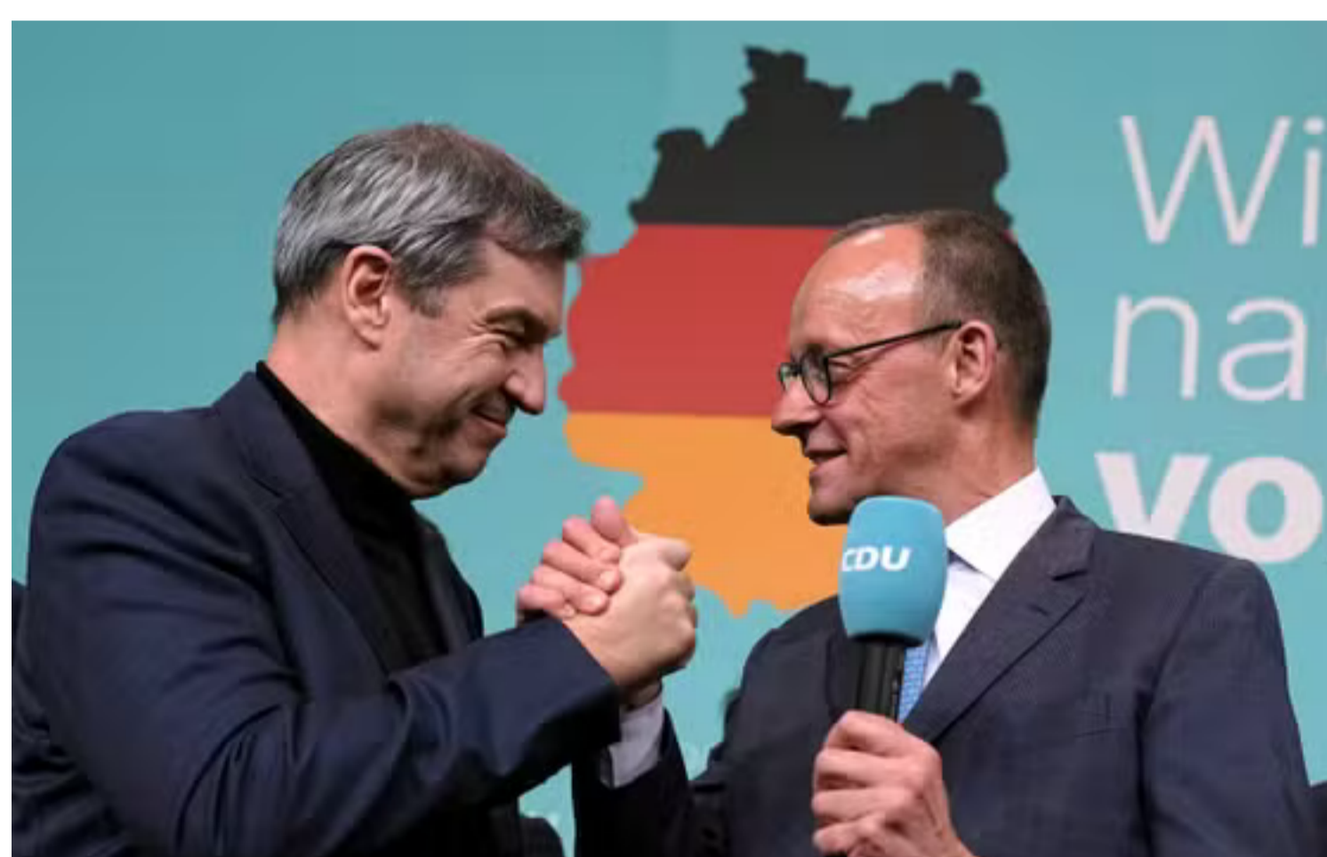
Markus Söder (left), leader of the Christian Social Union (CSU), and Friedrich Merz, leader of the Christian Democratic Union (CDU), at CDU headquarters, Berlin, February 23, 2025.

It was a symbol that said a lot about this election. On Sunday evening, posters of Alice Weidel, the German far-right candidate, were plastered in front of the entrance to the headquarters of the Christian Democratic Union (CDU) in Berlin, appearing to tower over the guests and activists waiting outside. A warning for the conservative party, which, although victorious in Germany's early elections on February 23 with 28.6% of the vote, has seen the gap between it and the Alternative for Germany (AfD) party almost halved since 2021. The far-right party is now the country's second-largest political force, with 20.8% of the vote, twice as much as four years ago.