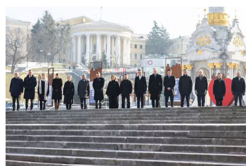
World leaders in Kyiv to mark three years of war in Ukraine as Zelensky hails 'resistance'