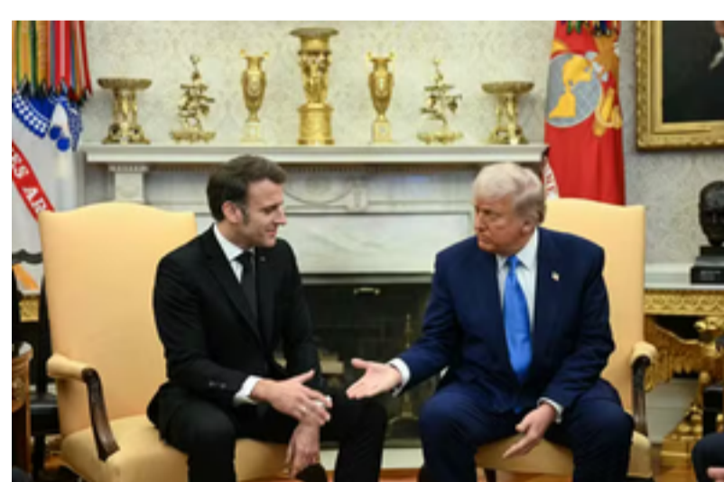
Macron warns Ukraine peace can't mean 'surrender,' after Trump talks