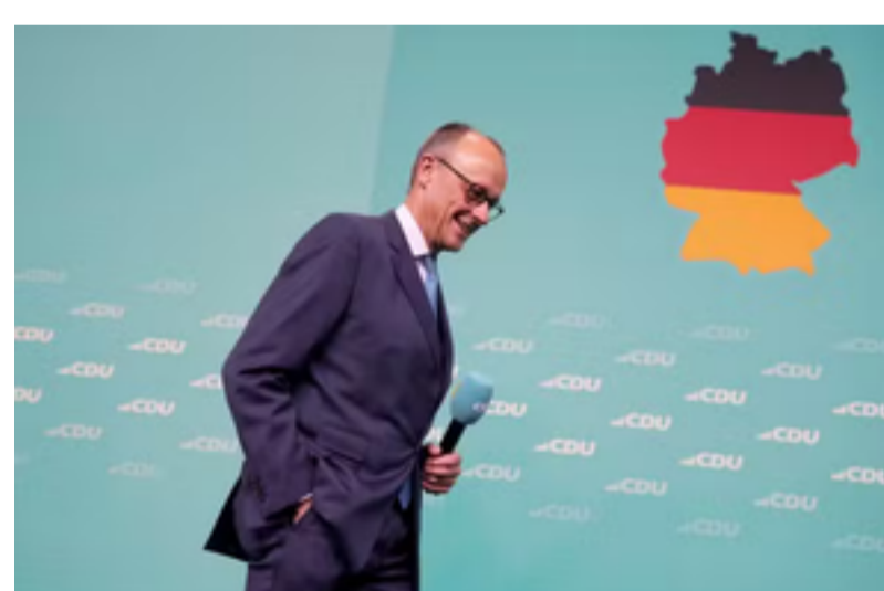
German elections: A triple tremor