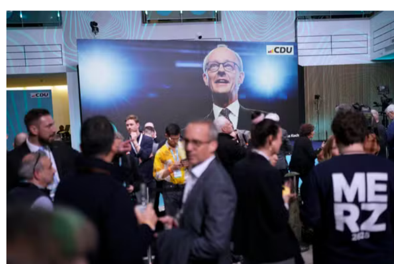
With election win, Friedrich Merz, rival of Angela Merkel, has revenge