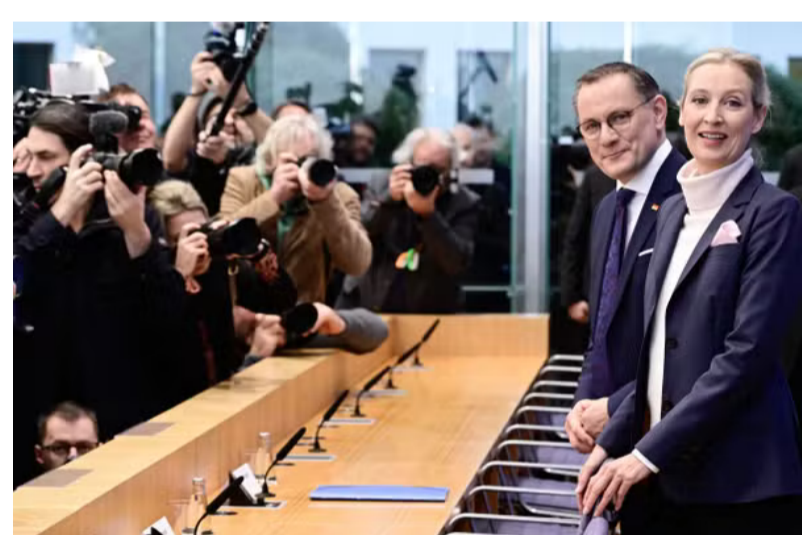
German elections: Far-right AfD party achieves historic result